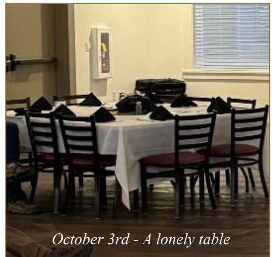
October 3rd - A lonely table

Please Plan ahead - Consult the Newsletter - and ... help your Chapter and Yourself by Showing up!